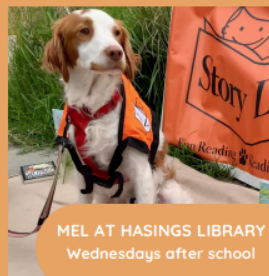
MEL AT HASINGS LIBRARY Wednesdays after school

Improve your child's reading with the help of a trained companion dog and handler.